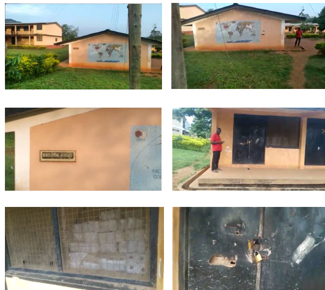
Sample Pictures of Similar NMSQ Training Studio/Center of Excellence in some SHS's