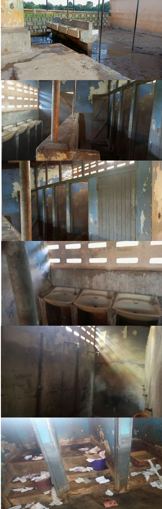
Renovated Bathroom of Aburi Girls SHS Showing Sample Pictures of the Squatting Toilet